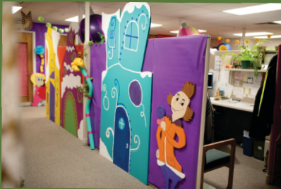
Child Support Enforcement Agency